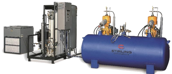
StirLIN-1 Extendible & StirLIN-2