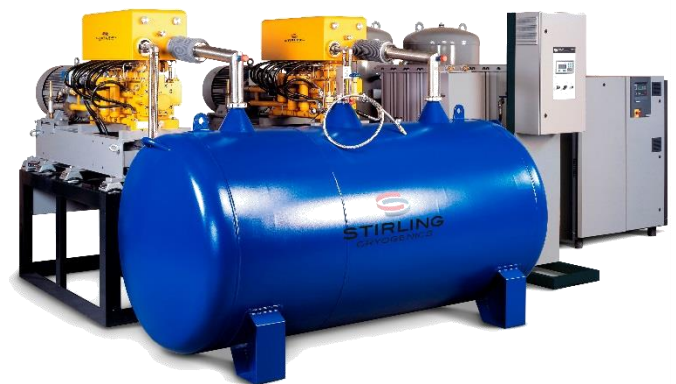
StirLIN-4 (Extendible) & StirLIN-8

Stirling Cryogenics is a registered trade name of DH Industries BV